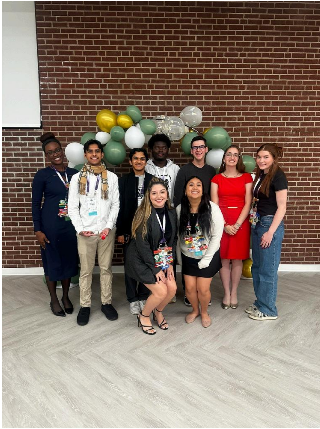
Delegates @ CAACURH