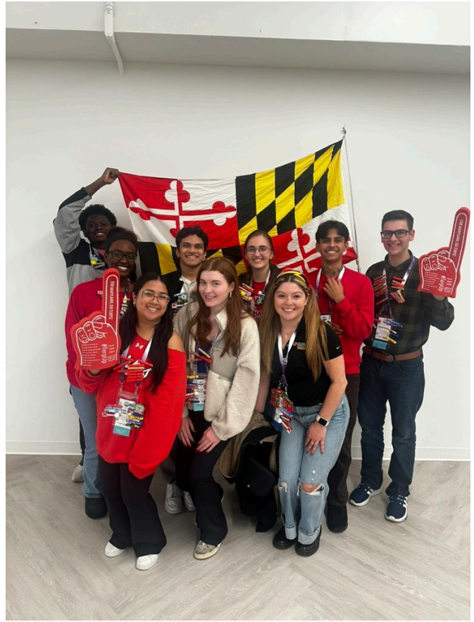
Delegates @ CAACURH

Missed a previous newsletter? Click here to see all of the RHA newsletters from past school years.