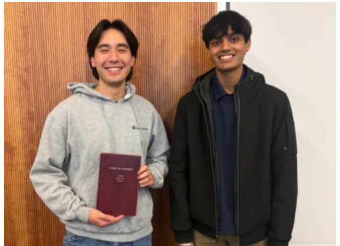
Senator Recognition @ Senate