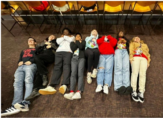
Delegates @ CAACURH