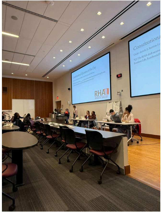
Last Senate @ ESJ