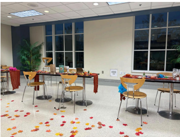
RHA Global Harvest Fest