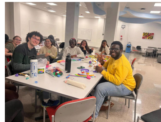
Denton Hall "Crafts + Chill"