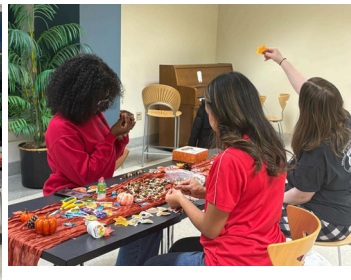
RHA Global Harvest Fest