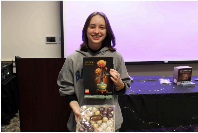
Winner @ Winter Wonderland Event