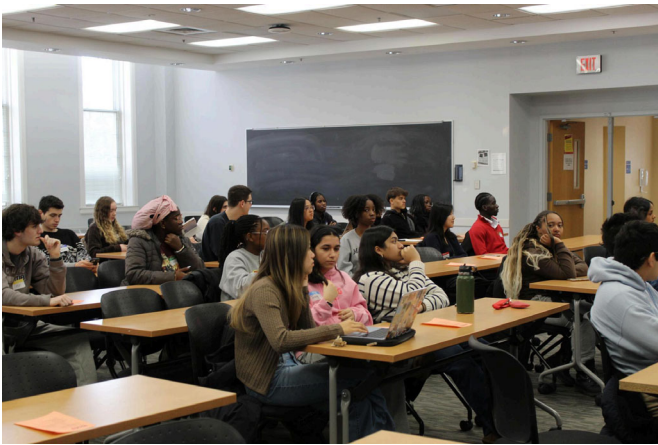
RHA Members @ LTD