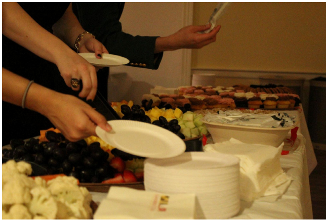
People getting food @ Hearts and Harmony Ball

Photos from the Hearts and Harmony Ball and Spring Leadership Training Day!