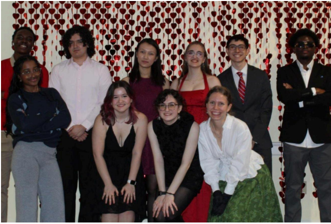
Executive Board @ Hearts and Harmony Ball