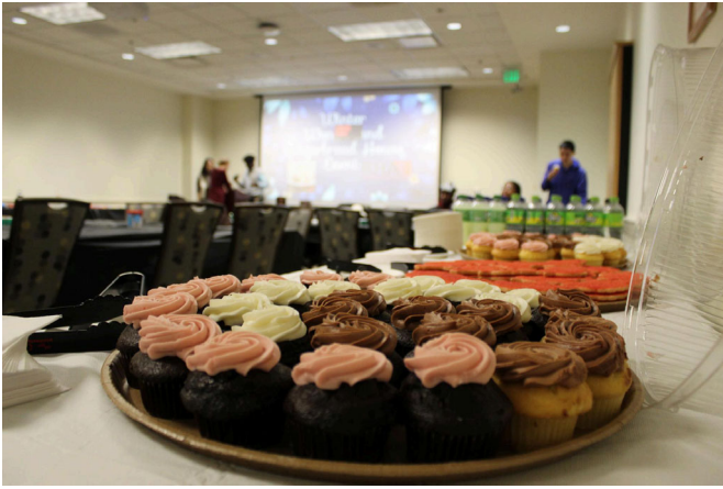
Food @ Winter Wonderland Event