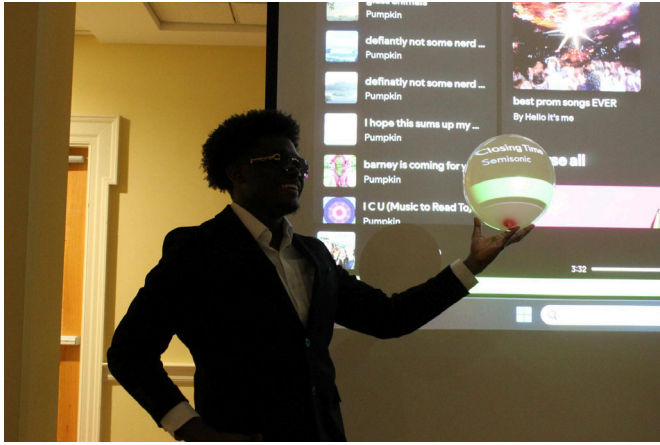
Attowla (nonchalant king) @ Hearts and Harmony Ball