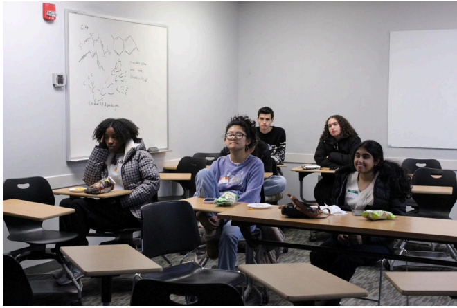
RHA Members during Educational Session @ LTD