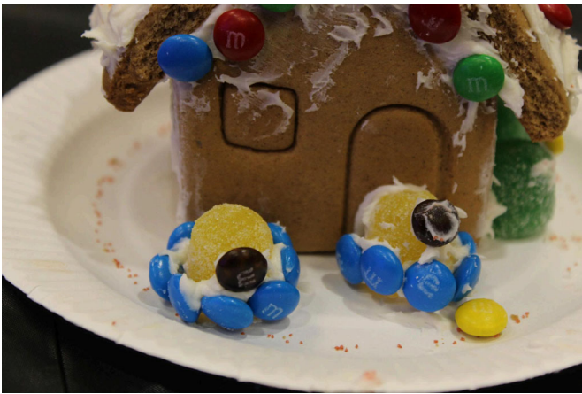
Gumdrop and M&M minions @ Winter Wonderland Event