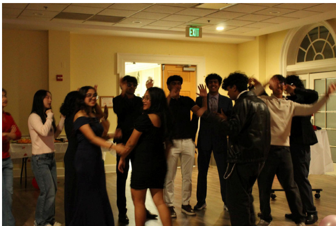
People dancing @ Hearts and Harmony Ball