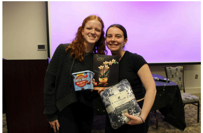
Winners @ Winter Wonderland Event