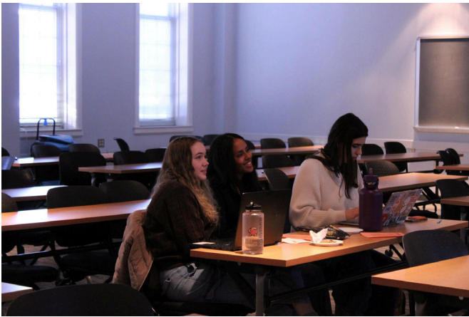
RHA Members during Educational Session @ LTD