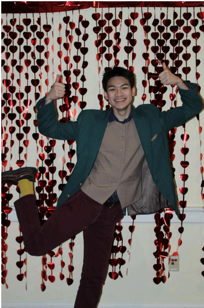
Attendee @ Hearts and Harmony Ball