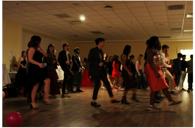
People dancing @ Hearts and Harmony Ball