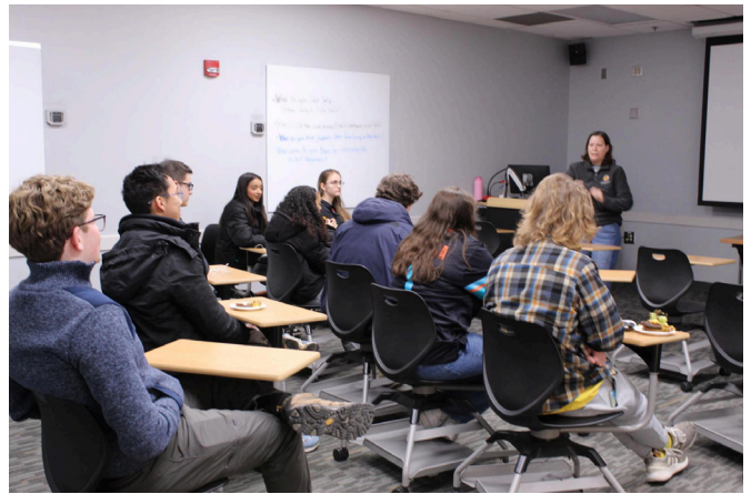
Resident Life Departmental Review Team Session @ LTD