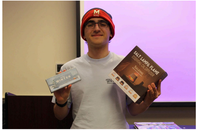
Winner @ Winter Wonderland Event