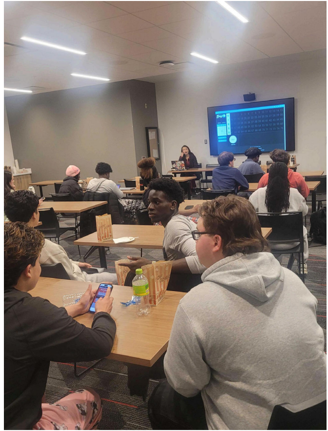
RHA Members playing bingo @ PJ Bingo BGM

Tuesday, December 2nd - During the Fall semester's last Senate meeting on December 2nd, Senators voted on and passed two bills, SK001F and CTK002F , both related to fee proposals ( MINUTES ).