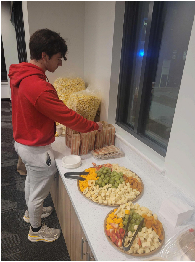
RHA Member getting food @ PJ Bingo BGM