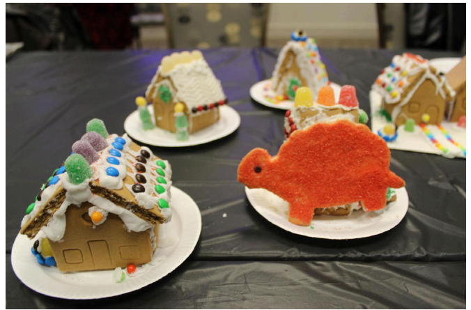
Gingerbread Houses @ Winter Wonderland Event