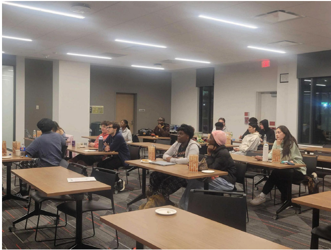
RHA Members @ PJ Bingo BGM

Thursday, November 20th - The RHA hosted its first General Body Meeting of the school year in November. The event was open to anyone in a hall or area council, including presidents, and all vice presidents with the purpose of team bonding within the organization and updating members on RHA happenings. Members met in the Pyon-Chen Multi Purpose Room for a comfy PJ-themed bingo night.