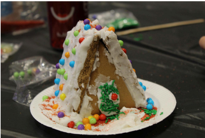
Gingerbread creation @ Winter Wonderland Event