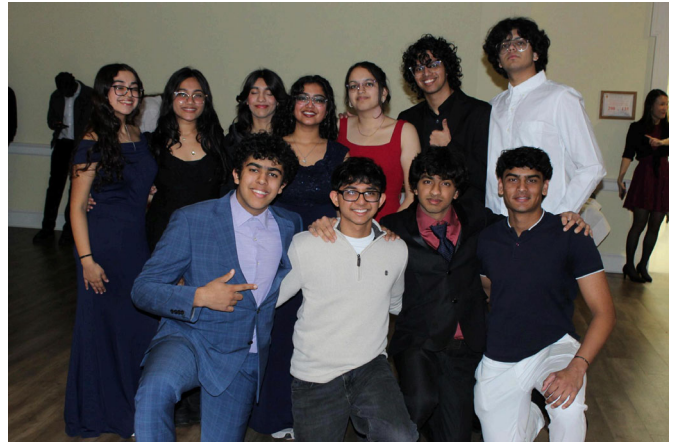
Group of students @ Hearts and Harmony Ball