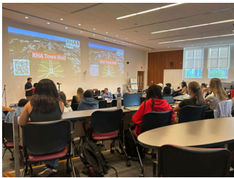
RHA Town Hall