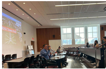
RHA Town Hall