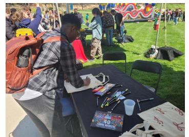
Tote bag painting at Earthfest

Missed a previous newsletter? Click here to see all of the RHA newsletters from this school year.