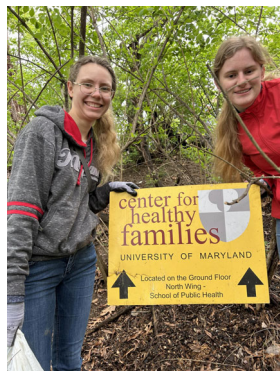
Maryland Beautification Day