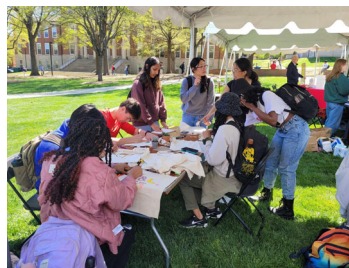
Tote bag painting at Earthfest