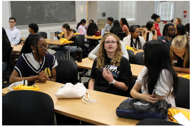
New RHA council members at LTD