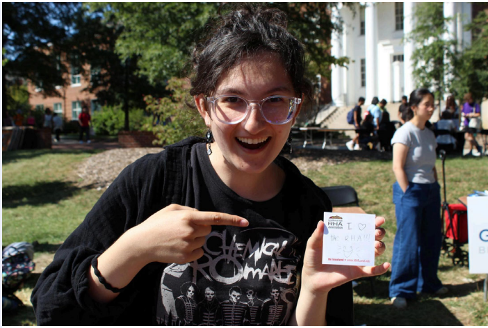
Student holding a "I <3 the RHA" drawing at the First Look Fair